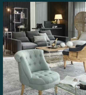
Classic Style / p. 20