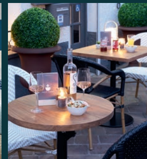
Outdoor / p. 26