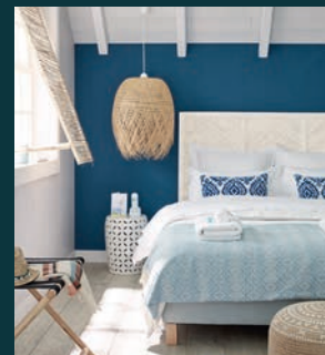
Seaside Style / p. 24