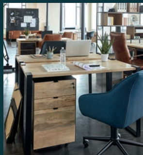
Industrial Style / p. 8