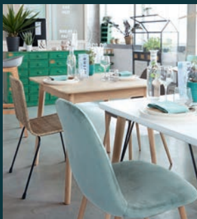
Contemporary Style / p. 2

A style-driven space, unique decor... You will really see the difference. And your customers will too!