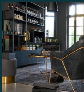
Vintage Style / p. 12